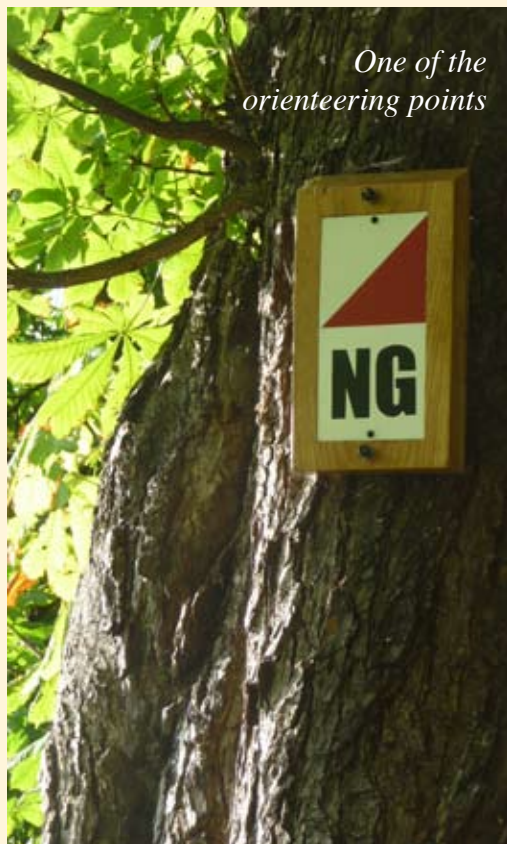
One of the orienteering points

This has been an excellent example of Community Partnership at work developing a truly community facility. Our thanks go to all of those who have supported and helped with this project. Plans are now being formulated to design a second course, this time in the Docks so that, more residents and communities can take advantage of the sport.